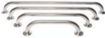
Bent Rails with Flanges