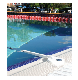
Lane Line Anchor for Overflow Pools