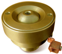
Bronze Deck Jet