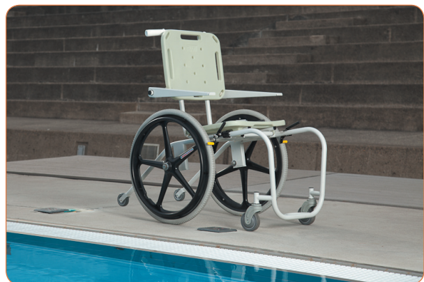
Mobile Aquatic Chair (MAC)

Mobile Aquatic Chairs are essential if your facility is using a ramp, zero-depth entry or movable floor. Additionally, Mobile Aquatic Chairs support user independence by enabling self-powered travel within the pool environment. Most traditional wheelchairs are not designed for aquatic environments and can suffer potential damage when used consistently in a pool environment. When it comes to wheelchairs, it makes good sense to have a chair that's built for your environment.