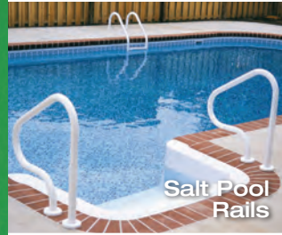
Salt Pool Rails