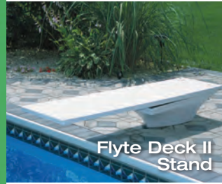
Flyte Deck II Stand