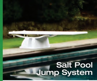
Salt Pool Jump System