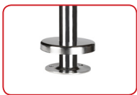
Flanged Model with Cover Plate Detail