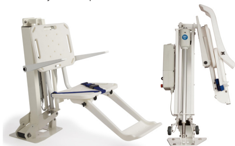
Optional folding seat assembly