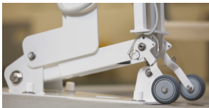
Wheel-A-Way mobility option provides flexibility to transport the lift if needed