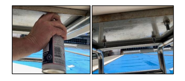
The new Retrofit platform is now ready for use: