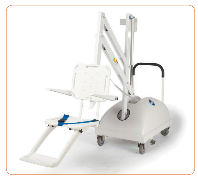
Portable Pool Lift

Portable lifts are perfect for busy, multi-use commercial facilities. These lifts require no physical installation or anchoring to the pool deck since stability is provided by a counter weight system. They are simply moved into place for use, and stored when not in use. They can be used at virtually any point along the pool deck* and most meet established ADA guidelines.