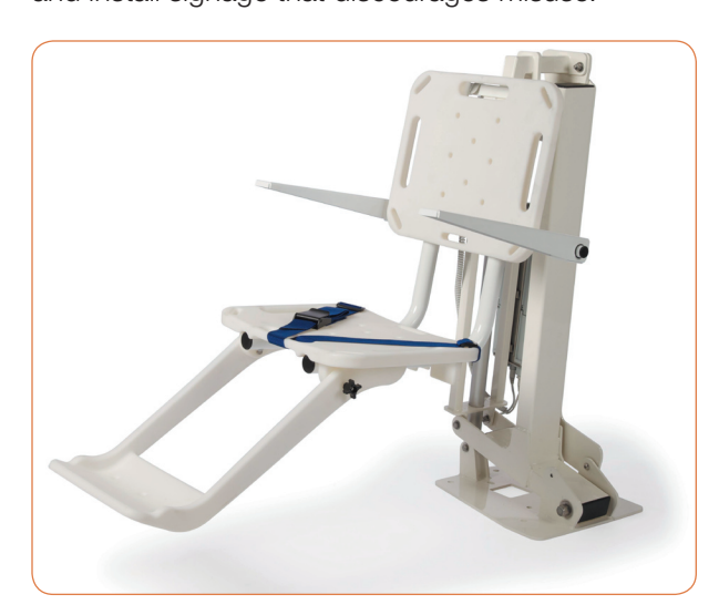
Permanent Pool Lift

Permanent lifts are fixed to the deck and typically have a higher lifting capacity than portable lifts. However, because they are not removable they have the potential to be viewed as a play structure by young swimmers. In light of this, it is recommended that facilities regularly check the unit to ensure it has not become an attractive nuisance and install signage that discourages misuse.