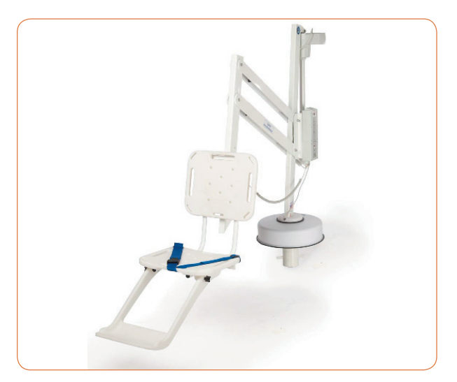
Removable Pool Lift

the lift's relocation. Removable lifts have the same features as portable lifts, however they can only be used from a fixed deck location. Because they are mounted into the deck, these types of lifts have a greater weight lifting capacity than their portable counterparts. In addition, removable lifts are generally less expensive than portable lifts however they do carry the added cost of installation.