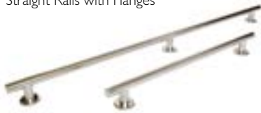
Straight Rails with Flanges