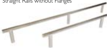
Straight Rails without Flanges

• No Sealed Steel or Powder-Coated on flanged models.