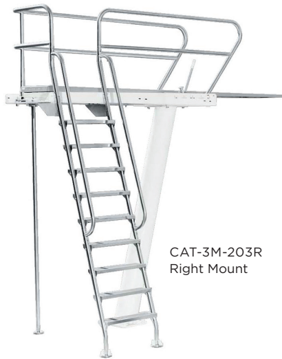
CAT-3M-203R Right Mount